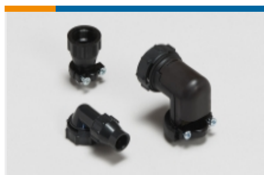
Unscreened Circular Connector Backshells &amp; Clamps(56)